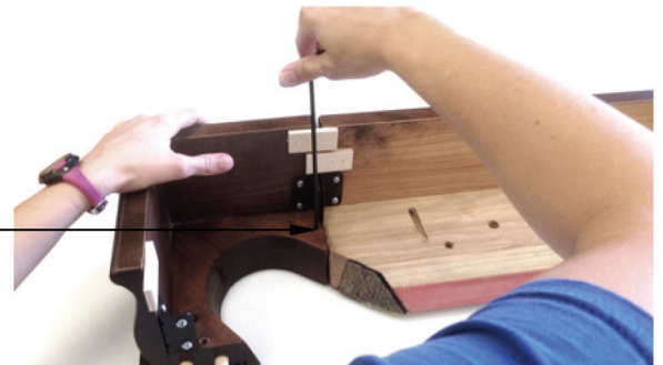
ACCESS HOLE FOR RAIL LOCK FASTENER