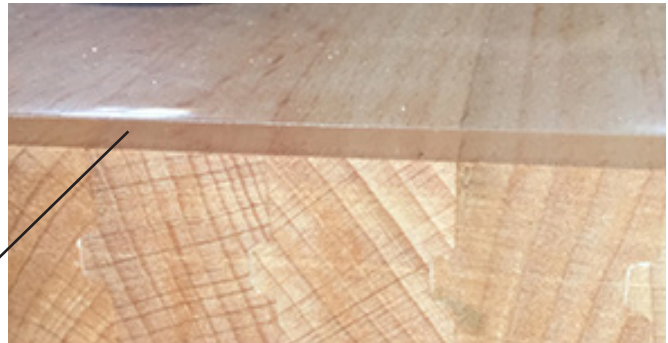
Approximately 1/8" thick poured polymer resin top resists yellowing.

4. Cal House playfields are balance-sealed and topped with a two-part poured polymer resin built to an average of 1/8" thick. The polymer we use resists yellowing and consists of 100% solids for a rock hard playing surface that will last. At first, we poured the polymer 1/4" thick. Then the chemist of the polymer manufacturer told us not to pour anything over 1/8" as a thicker build-up degrades the product.