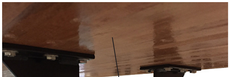
The bottom of our playfields are finished with the same polymer as the top to environmentally balance the board.

California House uses the same two-part poured polymer resin on the bottom of the board as we do the top. Several applications are applied to the bottom to seal and balance the board properly. The polymer costs $100's of dollars per gallon, but we feel it is worth it in the long run to have an environmentally balanced playfield.