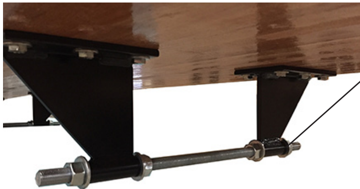
Double nuts lock in the adjustment of each playfield quickly and easily.

The Climate Adjusters are designed by Cal House and cut, welded, and powder coated in the USA. Climate Adjusters are incredibly important to the playability of the board. PLEASE compare other manufacturers against ours. And if the shuffleboard you are looking at does not have them at all, do not expect to enjoy your game for very long.